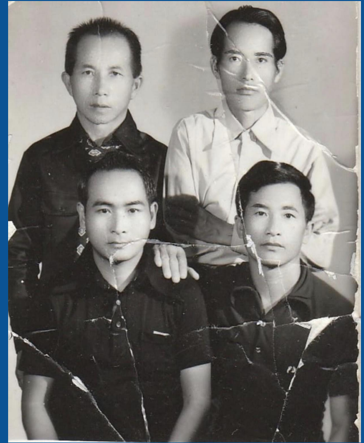
My grandfather is the bottom right

He was a spy undercover to gather intelligence on the enemy and to report back to base. Risking his life everyday for the benefit of the US, he did as told for his family and freedom.