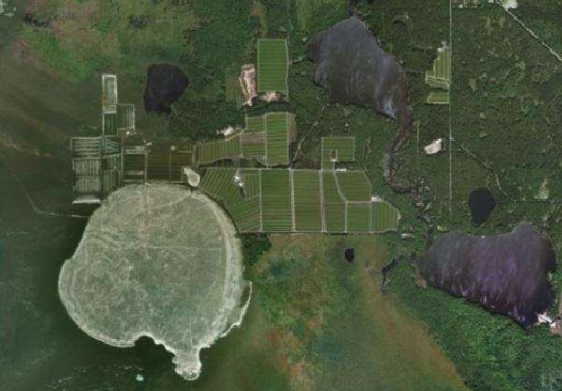
1937 Pre Cranberry Farms