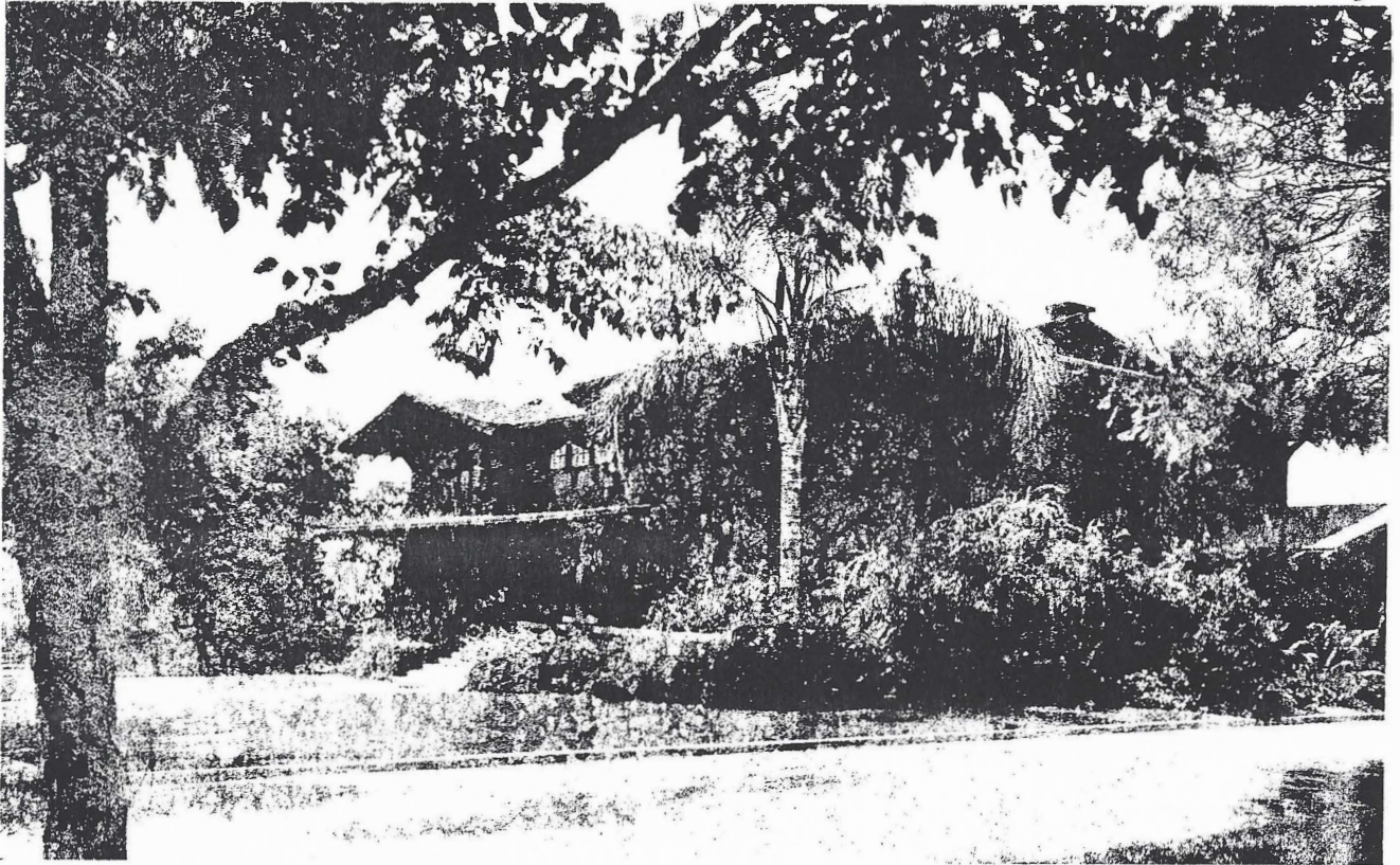
The A. J. Everest Home