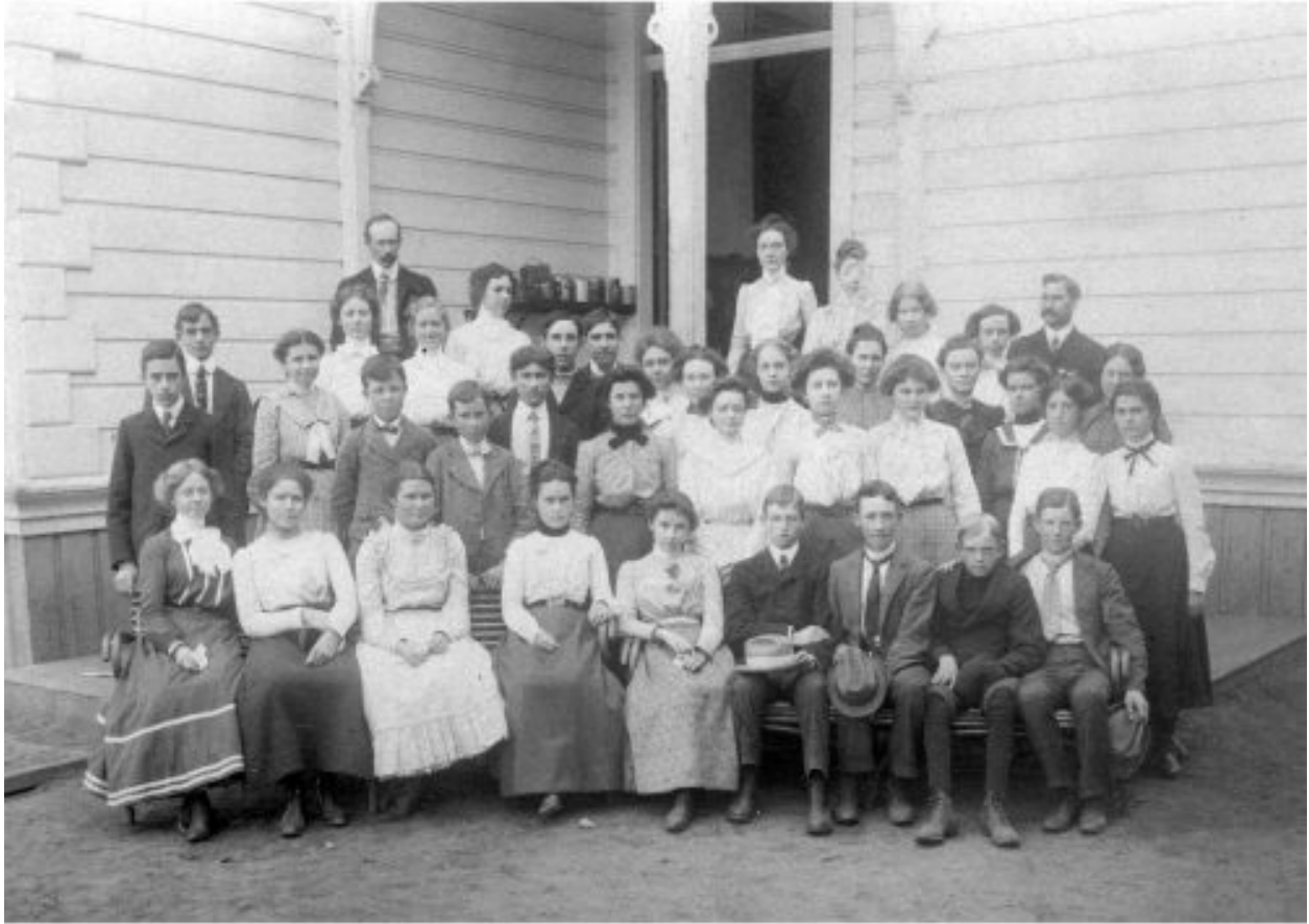
MHS class of 1900.

The year 1903 saw the construction of the Ivy Avenue School, located where Clifton Middle School is today. That building was intended for an elementary school, but it ended up as shared space with the high school, since the high school had outgrown its original home at the Orange Avenue School but could not afford its own building. The high school rented space until 1910, when it was able to purchase the site for $50,000 with the proceeds of a bond measure and the location became a high school campus only. The bond measure also made possible what was touted as a polytechnic high school building in a newspaper article published in 1910. The new building, designed by the Los Angeles firm of Allison & Allison, was completed in 1912 and served until 1929 when the high school moved to its present location. And it was that building that bore the quotation from Diogenes.