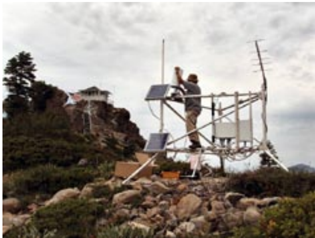
Just as the fire lookout and the remote automated weather station represent changes in the Forest Service fire program, enterprising represents a new way of doing business that supplements traditional ways of getting our work done.

In 1996, Duffy and Radloff crossed paths and compared notes. Radloff invited Duffy to brief Doug Farbrother of the NPR staff, and within a few months the group in Region 5 had been