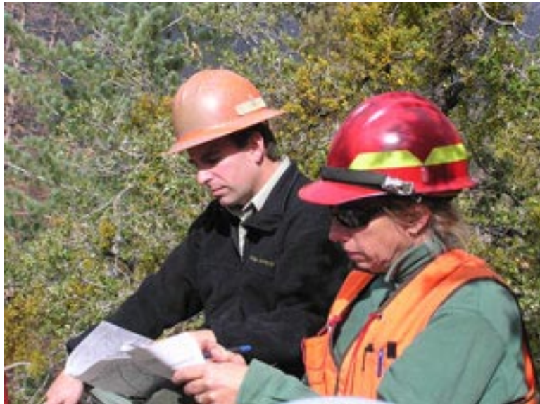
TEAMS Planning specialists work on the Thomas Mountain Fuels Reduction Project in Riverside County, CA, a collaboration between several state and federal agencies and the Cahuilla Indian Tribe.

success of the venture. They are well aware of the relationship between time and money. The full-cost recovery requirement drives enterprisers to be more efficient, yet customer satisfaction is paramount. Competition compels an enterprise to offer the best service