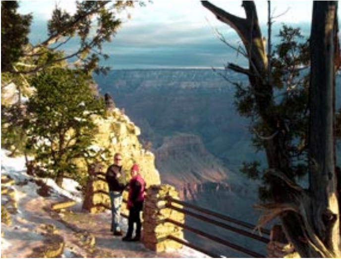
Enterprise Units may supplement their offerings by collaborating with another Enterprise Unit or subcontracting part of the work to private industry. Recreation Solutions and Adaptive Management Services collaborated on fuels planning for the Grand Canyon area.

are concepts that run counter to the agency's century of zero-sum budgeting. Consequently, the Enterprise concept met with resistance and generated misunderstandings at all levels of the agency. Preconceptions and false assumptions circulating about the program included claims such as Enterprise is more expensive; enterprisers are private contractors, not agency employees; enterprisers do not have to operate by the same rules; and enterprisers can take away jobs.