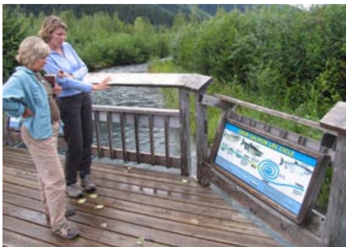
As the Forest Service continues to downsize, Enterprise Units are increasingly being called on for assistance, especially in niches like interpretation, where there are few employees with planning and design skills.

Along with criticism over its financial information the Enterprise Program received accolades. Customer surveys conducted for the Price Waterhouse Coopers (PWC) Report indicated a strong demand for products and services and a great deal of repeat business. PWC was actually the first reviewer to recommend program expansion. Their preferred option included expanding into additional regions and outsourcing financial management in order to address financial management problems which faced both the program and the agency at large.