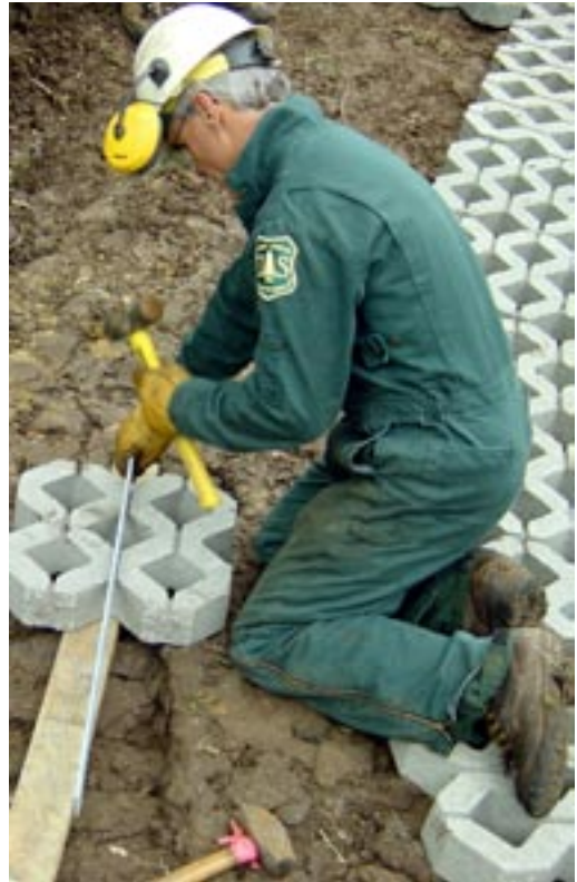
Enterprise Units like Trails Unlimited offer their expertise in the form of on-the-job training while helping their clients accomplish their work.

Enterprisers use their eye for efficiency of process not only to serve their customers, but also to grow a stronger program. In 2005, when the Forest Service centralized all budget and finance to the Albuquerque Service Center (ASC), the Reinvention Lab hired the Digital Visions enterprise to create a database that allows enterprises to interface online with