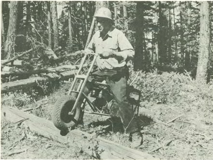
Tote-Gote Scooter A lightweight special-purpose scooter for general forestry use.