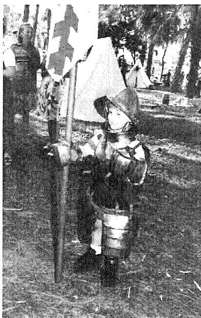
An ultimate dress-up at the Old Florida Festival!

The 18 th Old Florida Festival at the Collier County Museum on the Naples Courthouse grounds was a hit for thousands March 31 st and April 1 st . The Festival was made possible in part by a grant from Embarq Corporation to the Friends of the Collier County Museums.