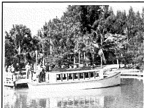
This late 1940s photo shows Kokomis setting sail with guests from Keewaydin Club headed back to Naples.

The Kokomis is a 70 year old flat-bottomed boat modeled on glass-bottomed boats made famous at Ocala's Silver Springs which