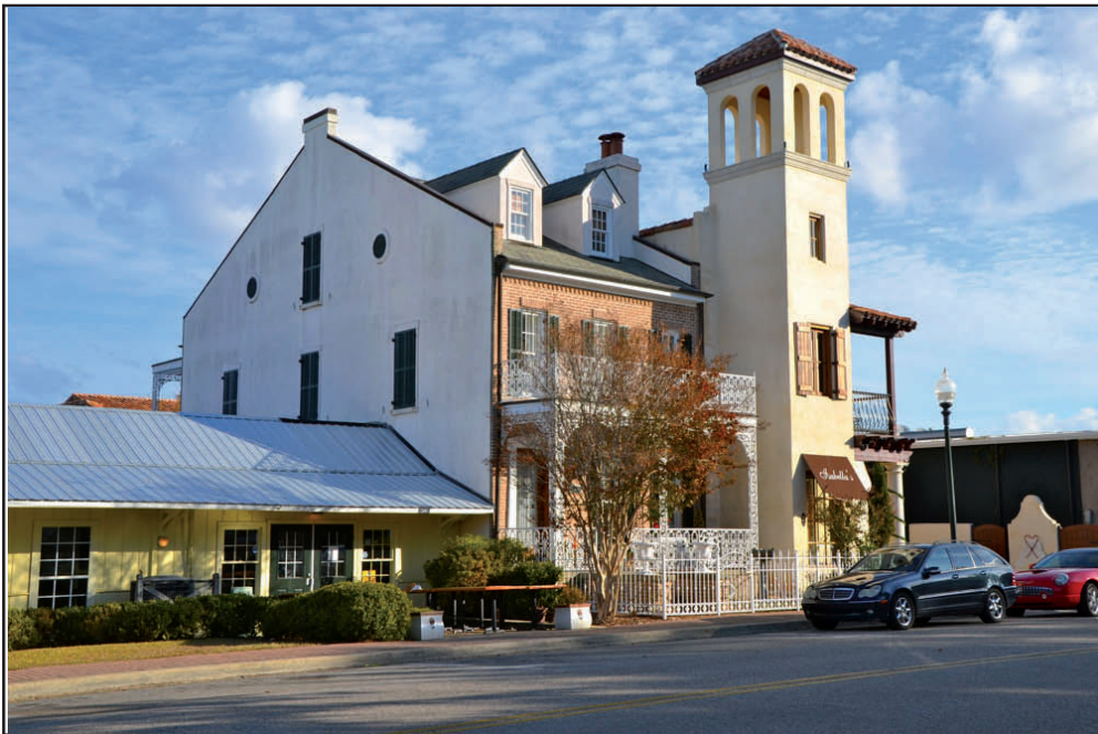
Downtown 018 A

No change in description or evaluation. 46-03-37-0-602-002.520; 303 Delemare Ave.