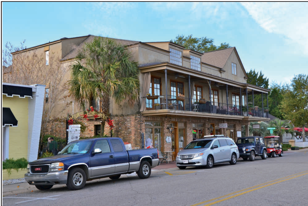
Downtown 023 A

No change in description or evaluation. 46-03-37-0-602-003.504; 315 Delamare Ave.