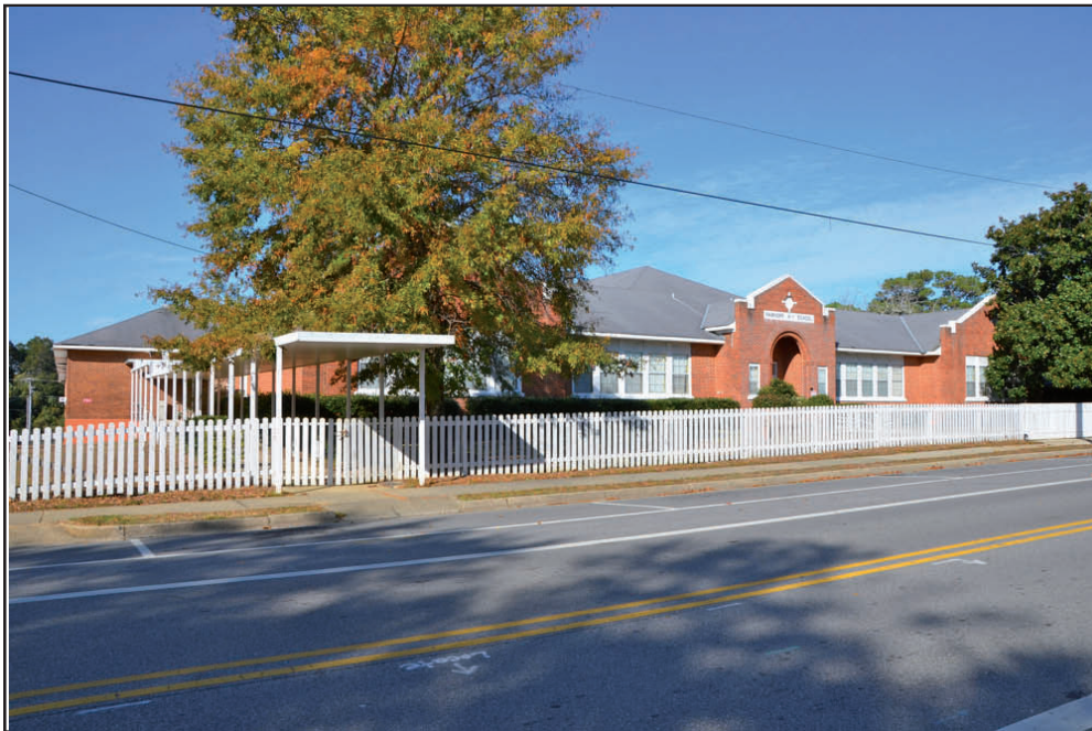
Downtown 017 A (at right: 017 B-E)

No change in description or evaluation. 46-03-37-0-006-045.000