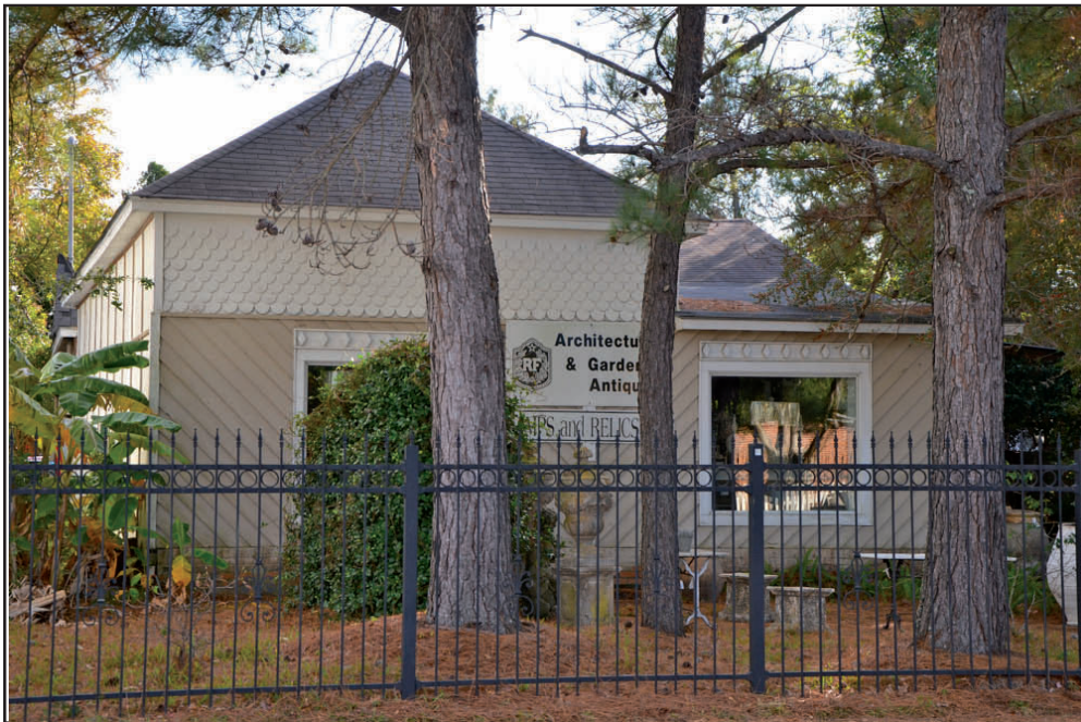
Downtown 015 A

No change in description or evaluation. 46-03-37-0-006-043.506; 61 Church St. S