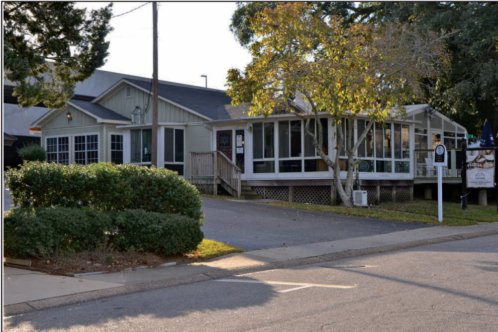
Downtown 005 A

No change in description or evaluation 46-03-37-0-601-002.511; 14 Church St. N