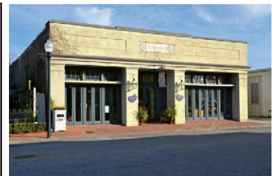
Downtown 024 A (at right: 024 B)