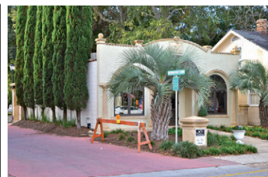
Downtown 021 A (at right: 021 B)