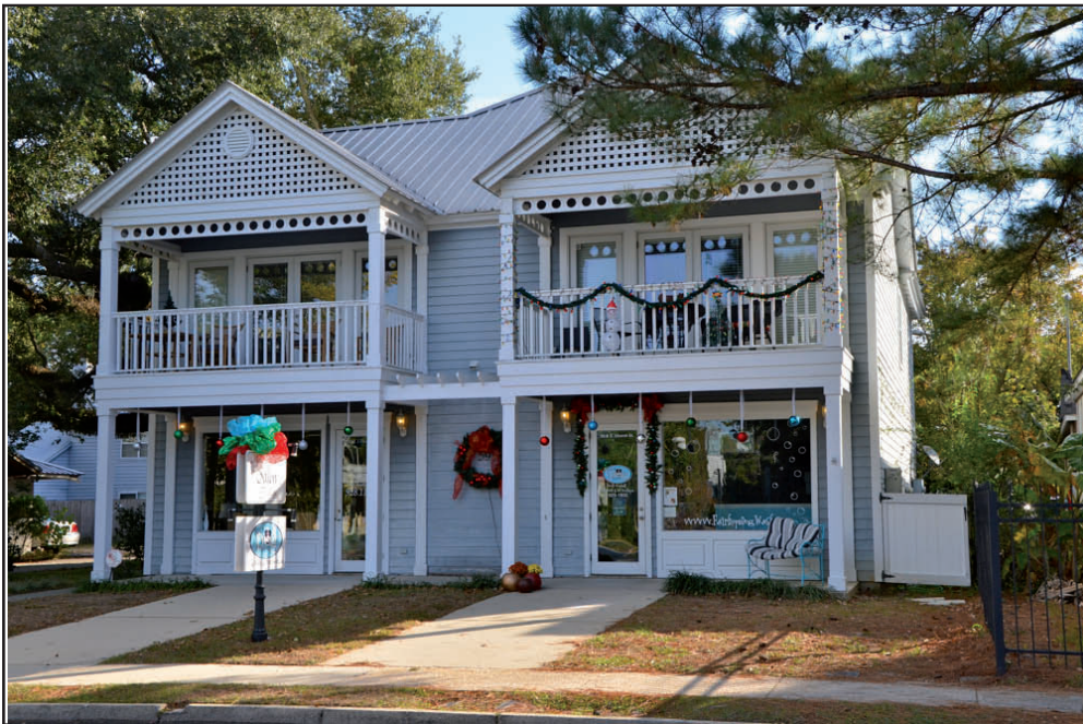
Downtown 014 A

No change in description or evaluation. 46-03-37-0-006-043.505; 59 Church St. S