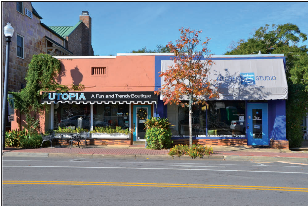
Downtown 009 A

No change in description or evaluation. Historically 1 building but lot now subdivided into two parcels 46-03-37-0-602-001.509; 8 Church St. S 46-03-37-0-602-001.508; 10 Church St. S