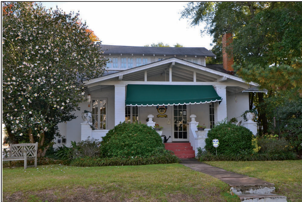
Downtown 012 A (at right: 012 B-E)

No change in description or evaluation. 46-03-37-0-006-043.503; 51 Church St. S