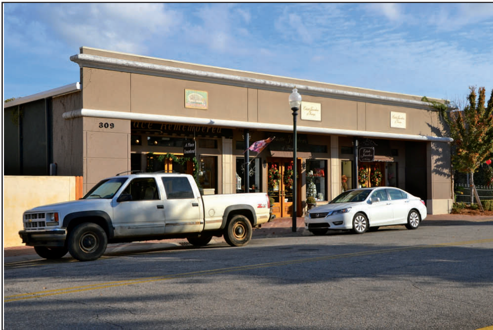
Downtown 020 A

46-03-37-0-602-002.504; 320 Fairhope Ave. Address on the building is 309 rather than 305-309 as listed in the NR nomination; this resource is located at the rear of this property and has a separate address.