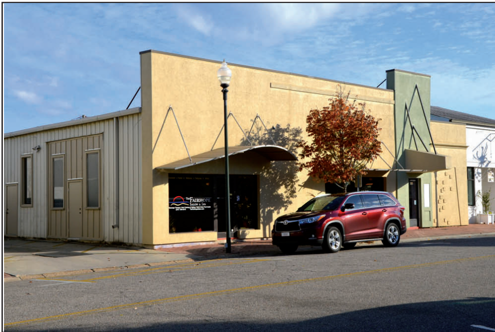
Downtown 025 A

No change in description or evaluation. 46-03-37-0-602-002.514; 323 Delamare Ave.