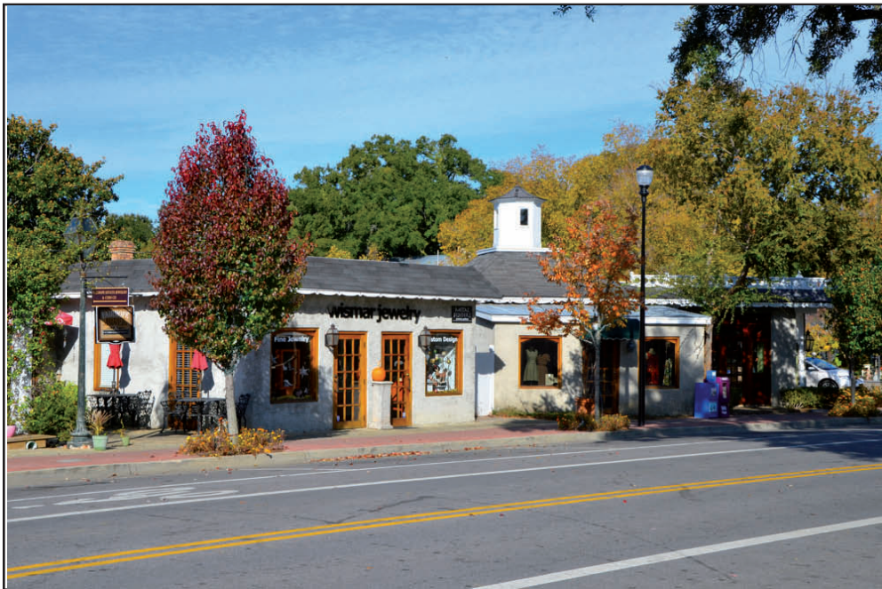
Downtown 006_007 A

Updated Information, This Study Sort: Reclassify as Noncontributing Contributing/Noncontributing: Noncontributing Appears to have been altered after 2004 and to no longer retain integrity. 46-03-37-0-602-001.506; 2 Church St. S