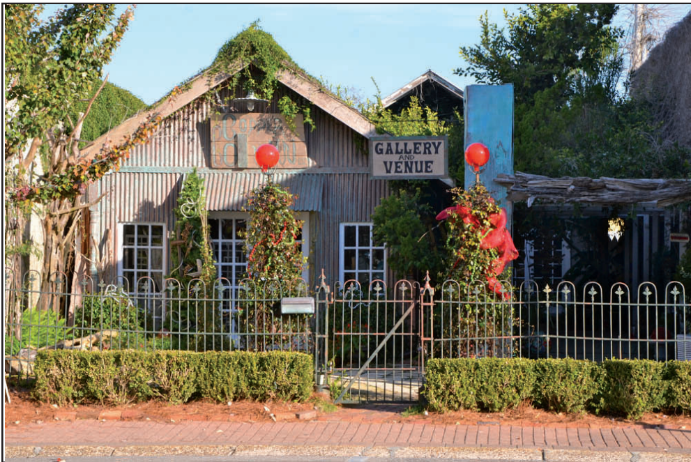
Downtown 022 A

46-03-37-0-602-002.505; 324 Fairhope Ave.; this resource is located at the rear of this property and has a separate address of 311 Delamare Ave.