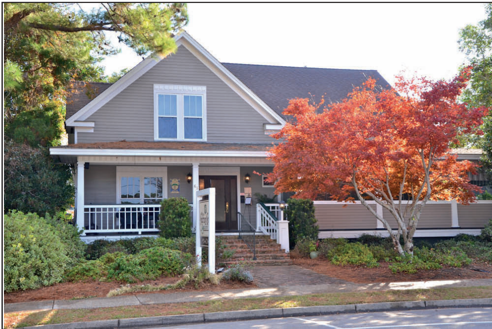
Downtown 016 A

No change in description or evaluation. 46-03-37-0-006-043.507; 63 Church St. S