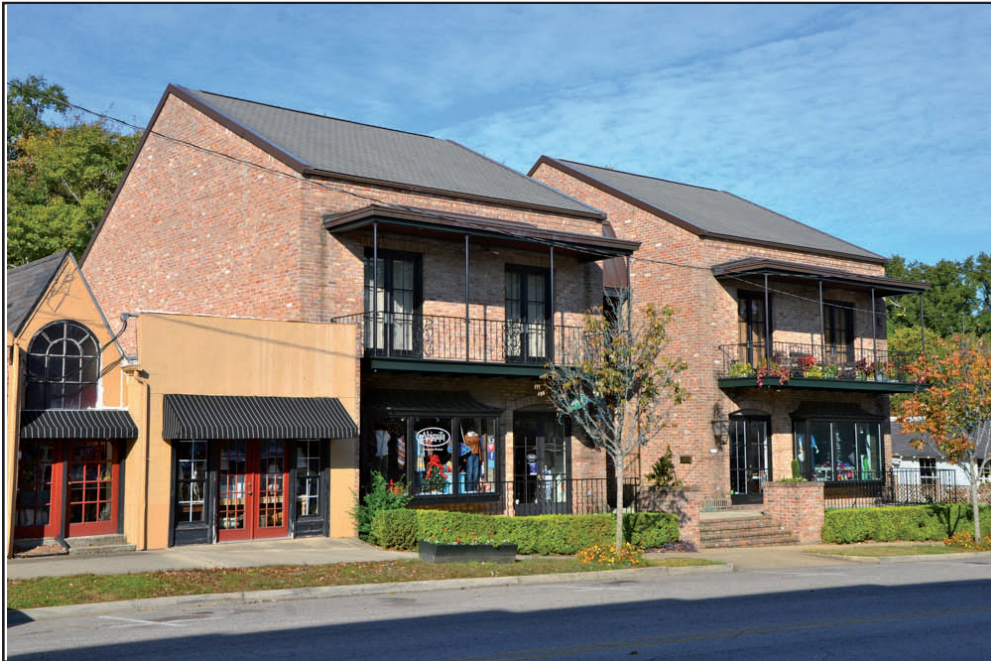
Downtown 001 A

Assessor Parcel: 46-03-37-0-601-003.514 and 46-03-37-0-601-003.511; 5 Church St. N