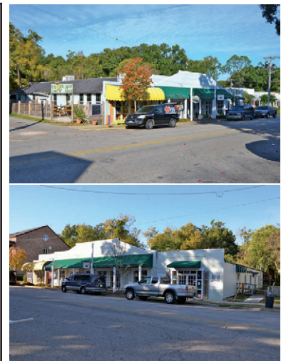
Downtown 004 A (at right: 004 B-C)