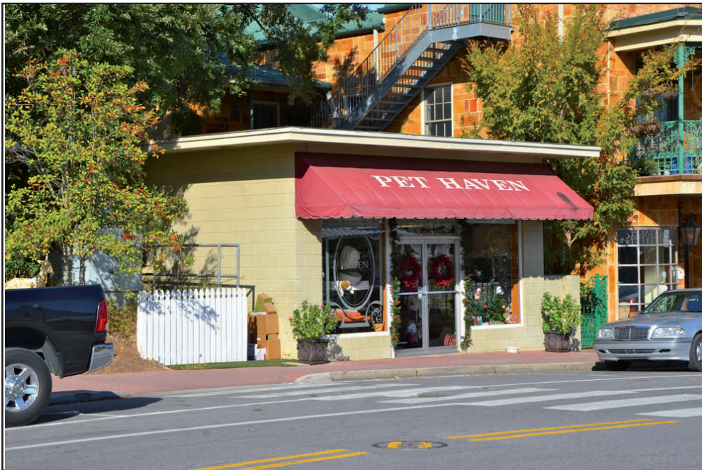
Downtown 011 A

No alterations after ca. 1955, should be reclassified as contributing. 46-03-37-0-602-001.505 ; 16 Church St. S