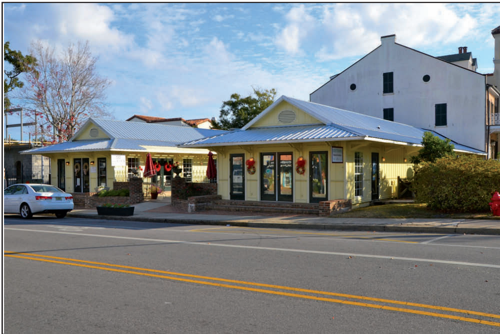
Downtown 008 A

No change in description or evaluation. 46-03-37-0-602-002.515; 7 Church St. S