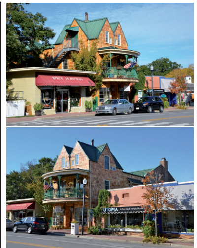
Downtown 010 A (at right: 010 B-C)