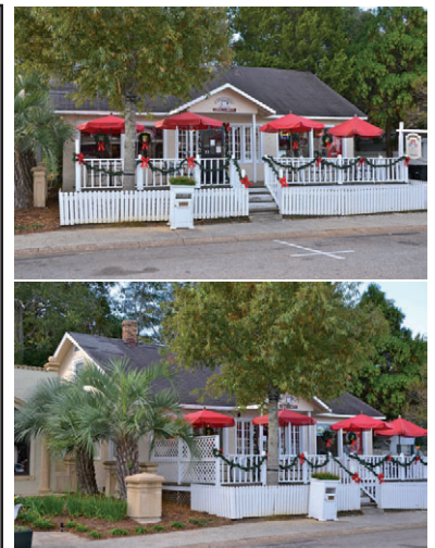
Downtown 019 A (at right: 019 B & C)