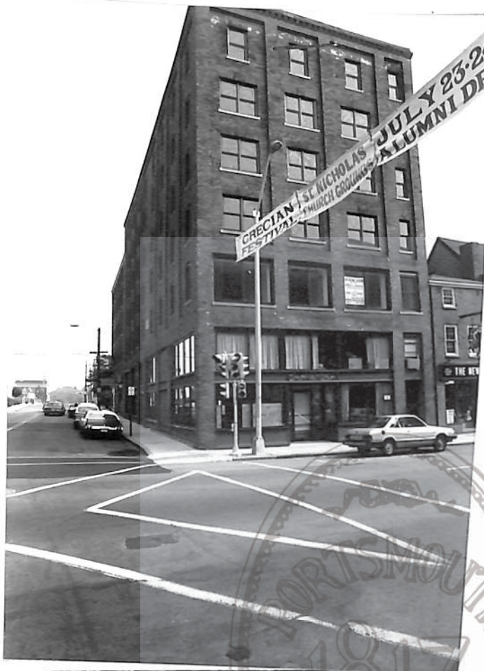
Photo roll no. Negative with: Portsmouth Advocates Description Date taken by

1. Style commercial classical No. of stories 7/5 No. of bays